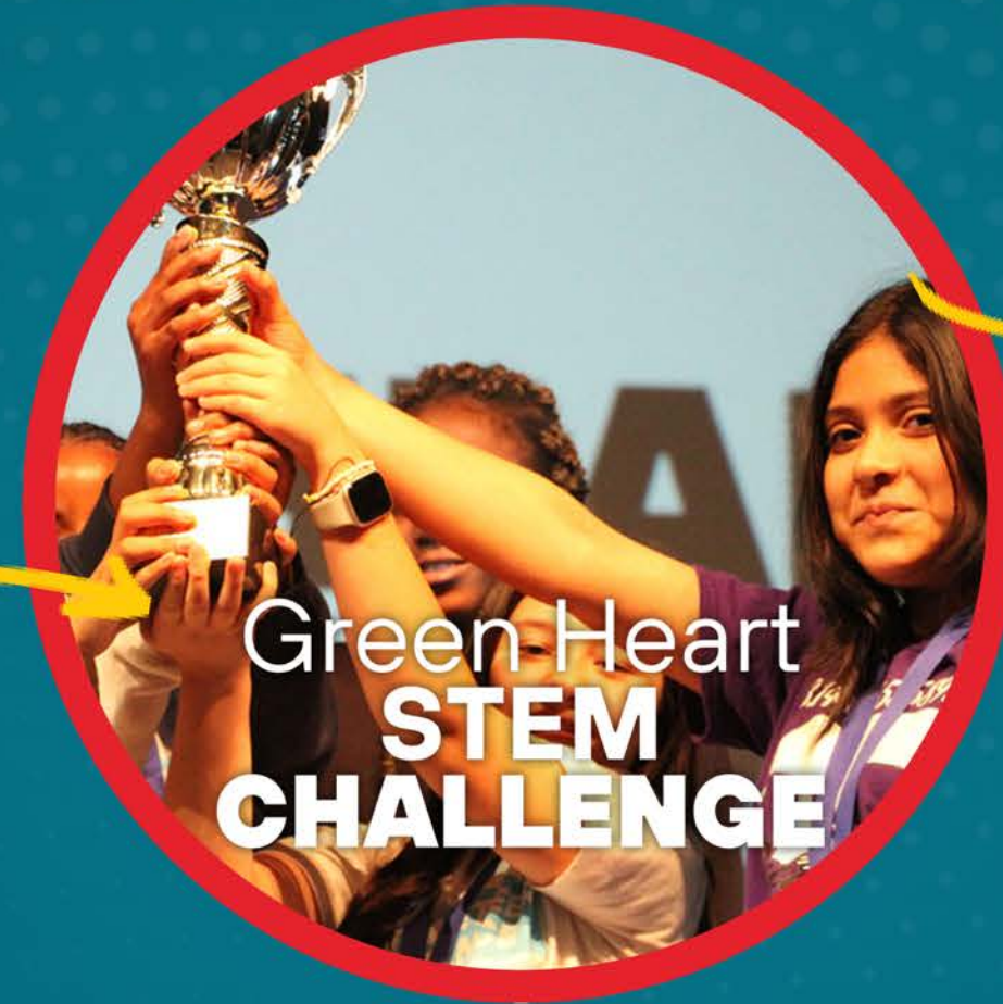
Green Heart STEM CHALLENGE