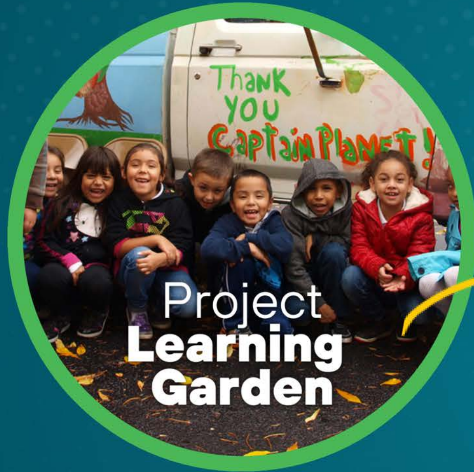
Project Learning Garden